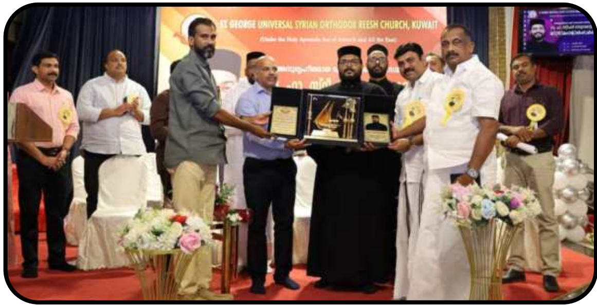
Vicar's farewell organised by St. George Church 15/05/2026