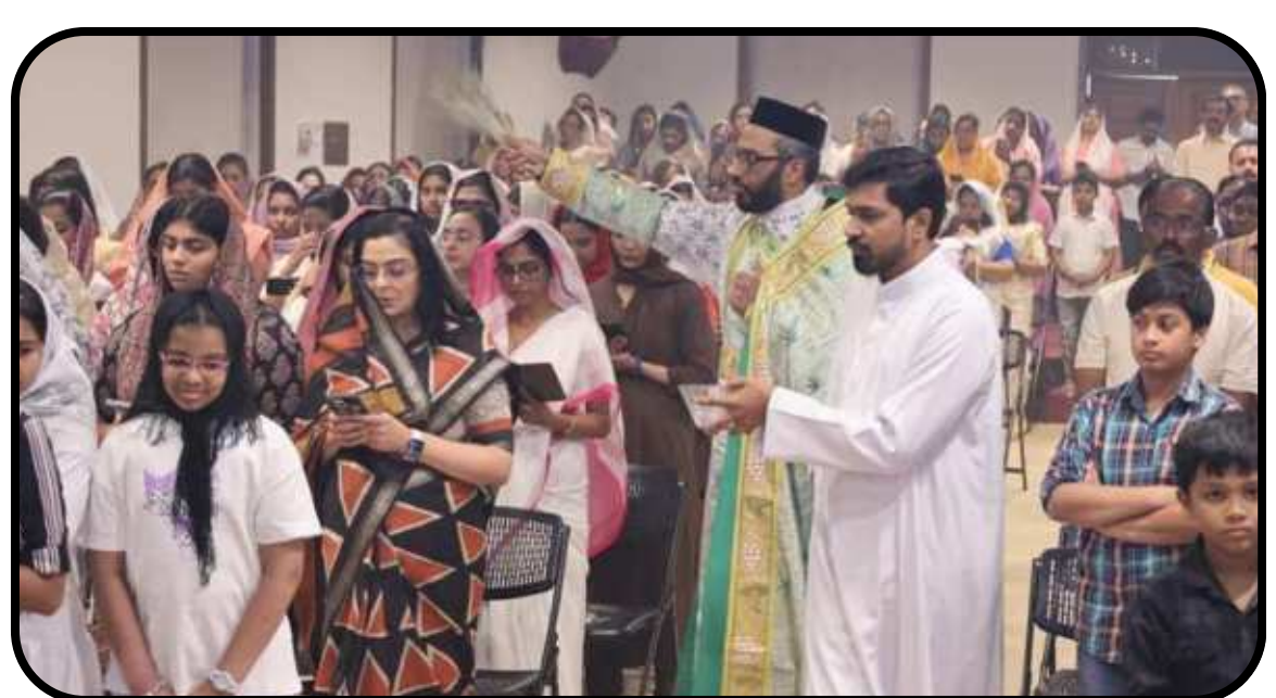
Pethakosthi Service @ NECK 22/05/2026