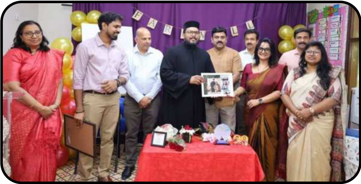
Vicar's farewell organised by MAJSS 15/05/2026