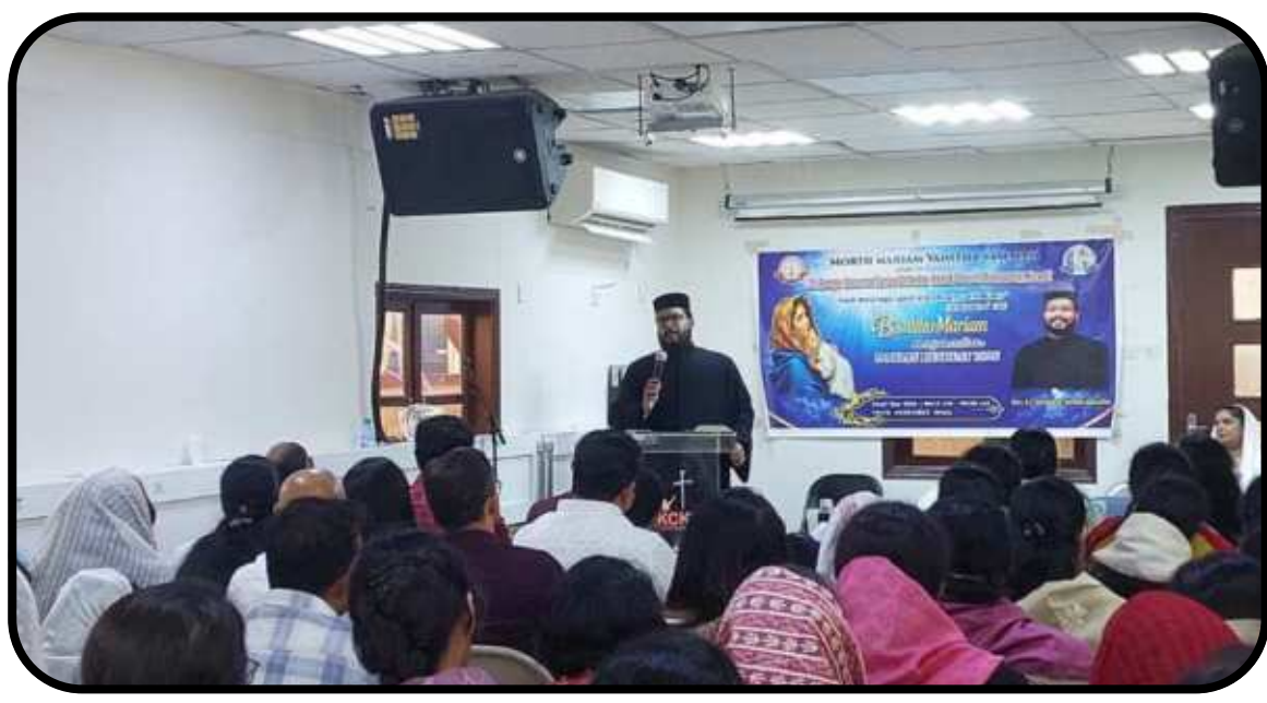
MMVS Marian Retreat "B'sultho Mariam" 22/05/2026