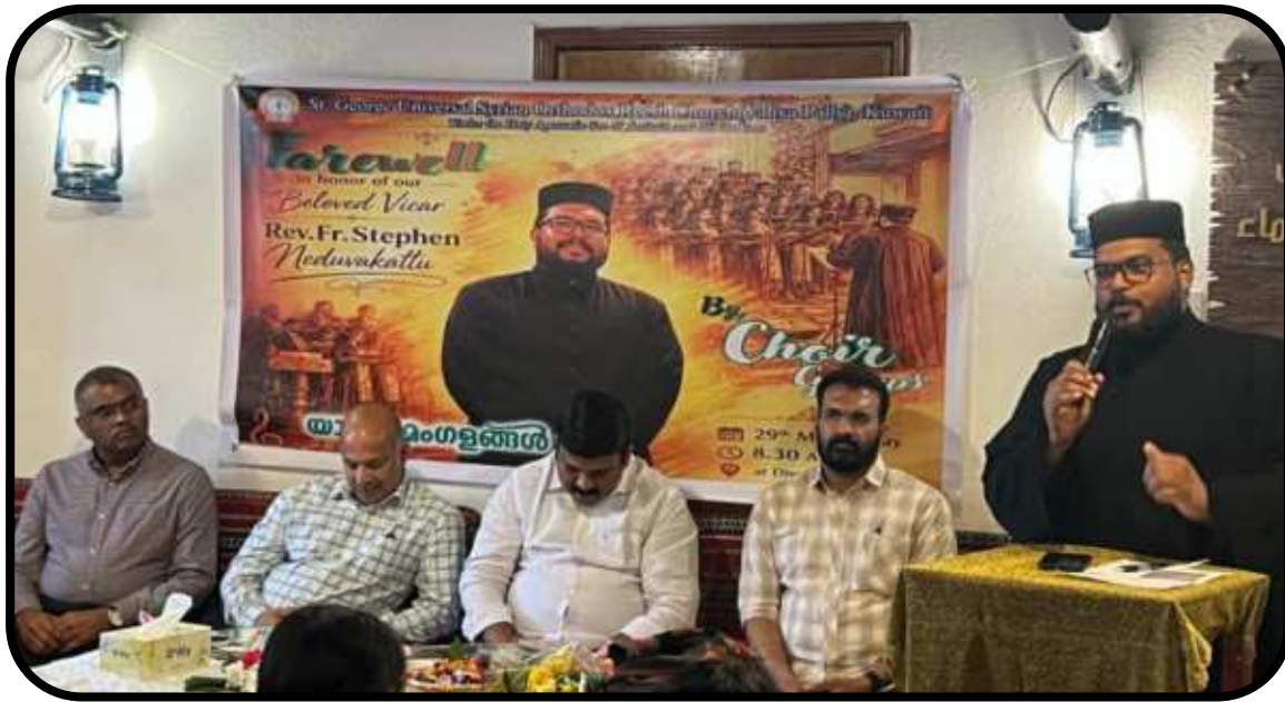
Vicar's farewell organised by Choir 29/05/2026