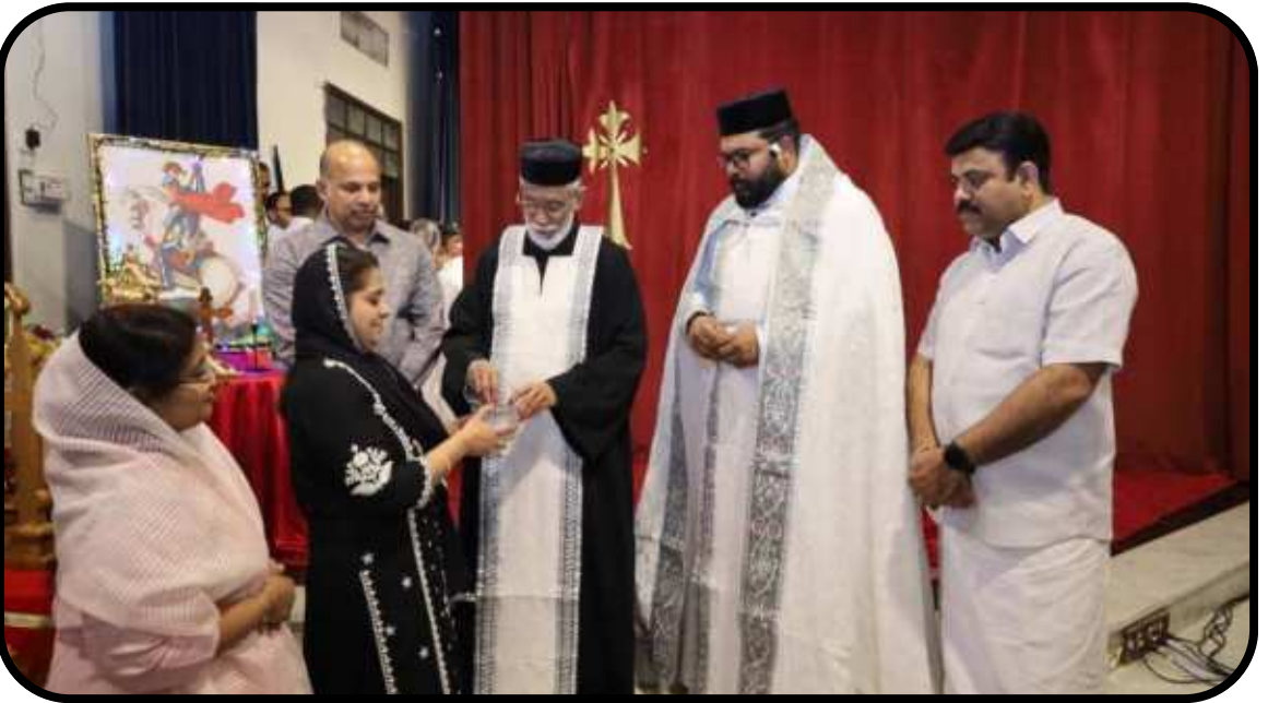
MMVS's draw for the financial aid for the marriage of a needy girl