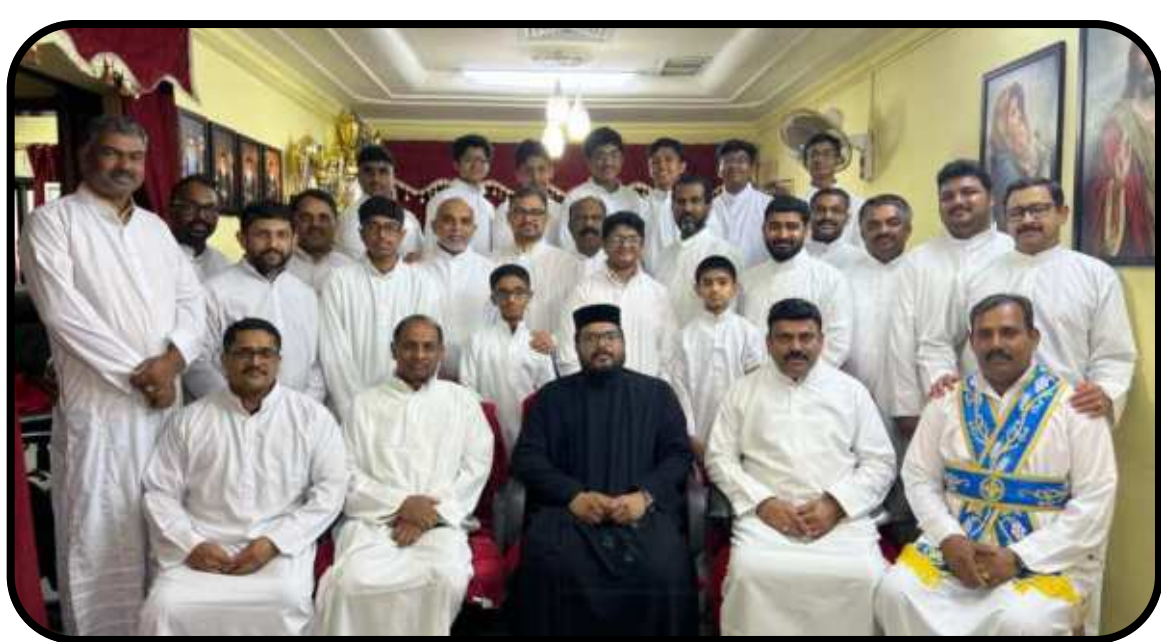
Vicar's farewell organised by Altar assistants 08/05/2026