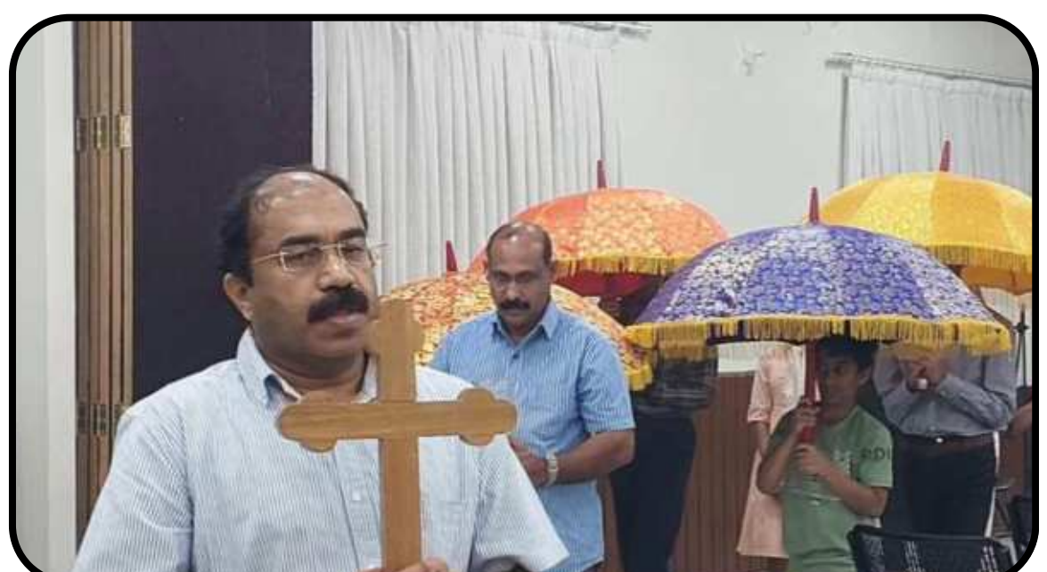
St. George Perunnal @ NECK Hall of Faith 04/05/2026