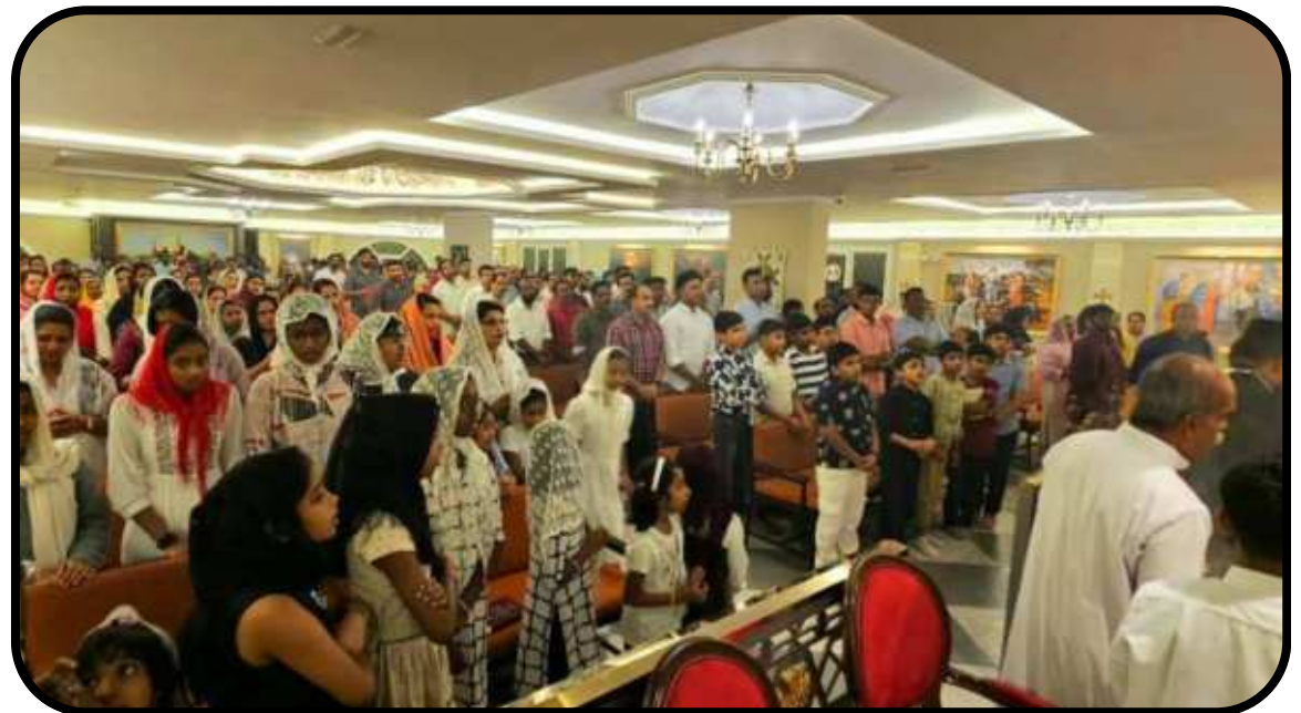
St. George Perunnal @ Salwa Armenian Church 02/05/2026