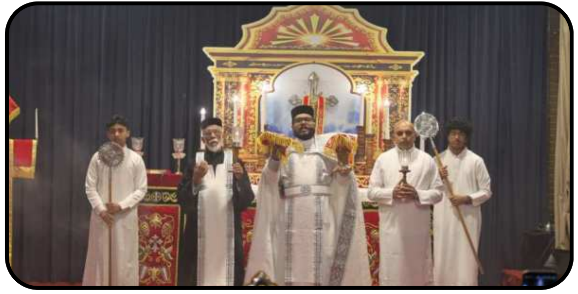
St. George Perunnal @ NECK Church 01/05/2026