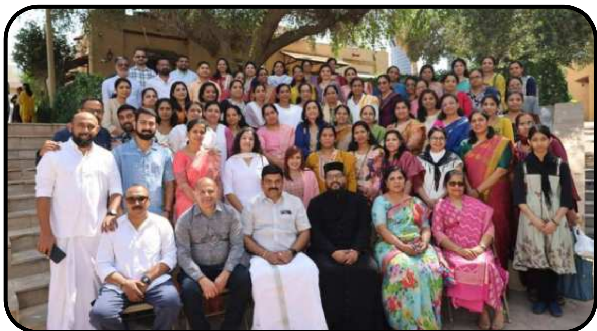
Vicar's farewell organised by HCM 01/05/2026