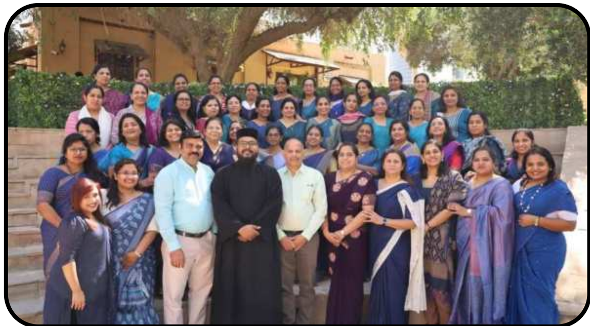
Vicar's farewell organised by MMVS 24/04/2026