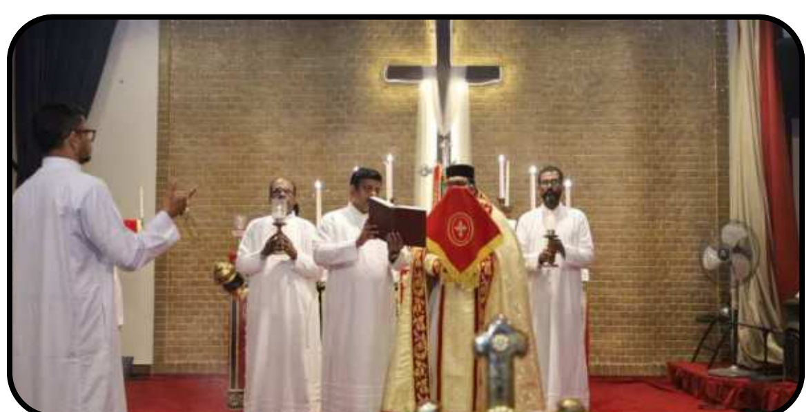
Swargarohana Perunnal @ NECK Church 15/05/2026