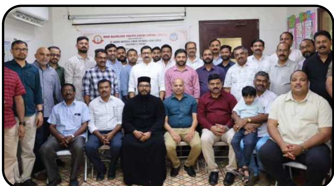
Vicar's farewell organised by MBYA 08/05/2026