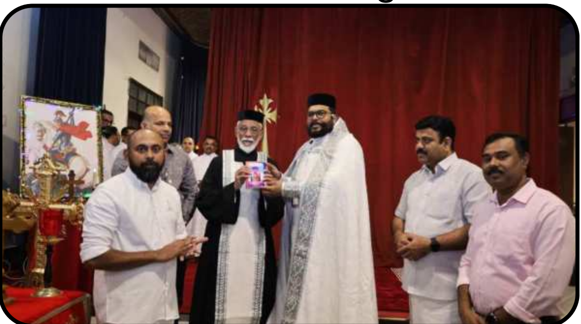
MBYA's Songs and Prayers book reveal on 01/05/2026